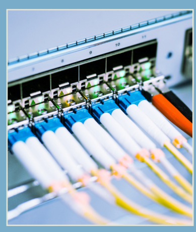
Resilient IPv6-enabled backbone with connections to hundreds of network operators at seven Internet Exchange Points.